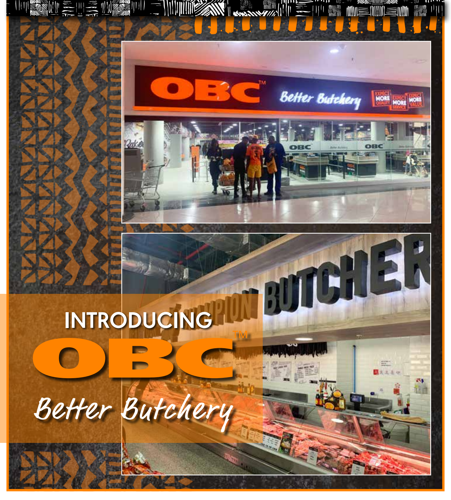
"The OBC Group has been in the retail industry for over 37 years with over 90 stores nation-wide."